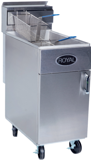
RFT-50 with optional casters